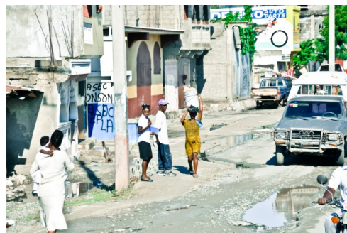
Driving through the city on our first