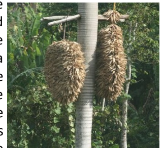
Corn hanging from a palm tree

their goods. The temperature cooled and the soil became richer looking with a reddish color. The trees were more plentiful and the people and animals were healthy. These people are poor in the aspect of money, but rich in so many other ways.