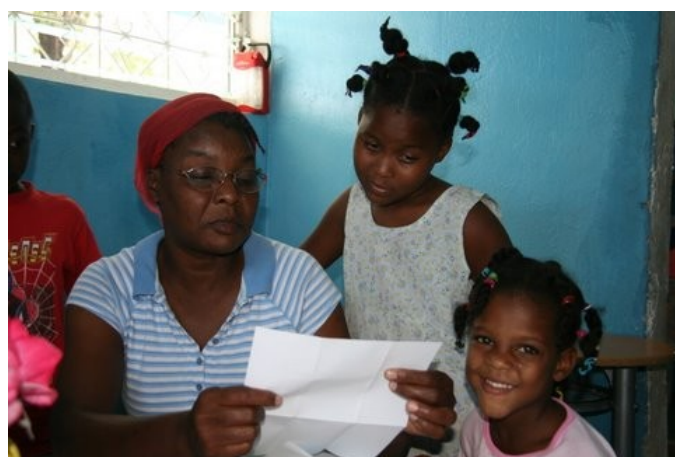
Dada reading letters to the kids from their sponsors.